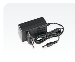
24 V 1.2 A power adapter