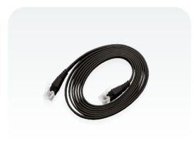
UTP Flat Cable (1.5m)