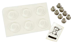
Screw and feet kit