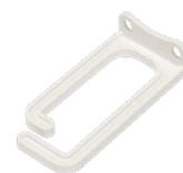
Cable management brackets