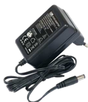
24 V 0.8 A power adapter