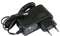
24 V 0.38 A power adapter