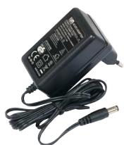
24V 0.8A power adapter