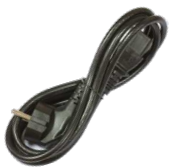
2 IEC cords