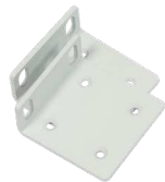
Rackmount bracket white