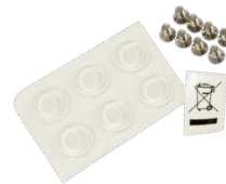
Fastening set for rackmount case