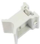
Pole mounting bracket