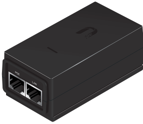
POE-15-12W POE-24-12W POE-24-12W-G