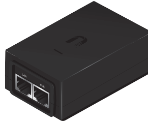
POE-24-24W POE-24-24W-G POE-24-30W