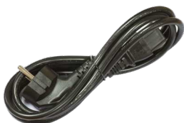
2 IEC cords