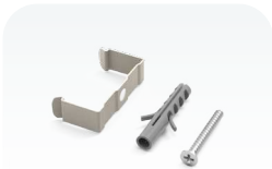
K-73 fastening set