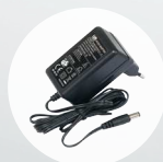
24V 0.8A Adapter