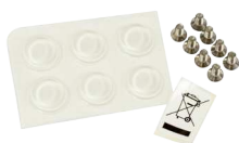
Screw and feet kit