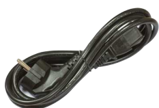
2x IEC cords