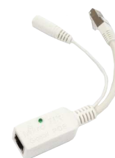
Gigabit PoE injector