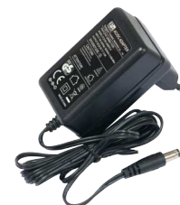
24V 0.8A Power adapter