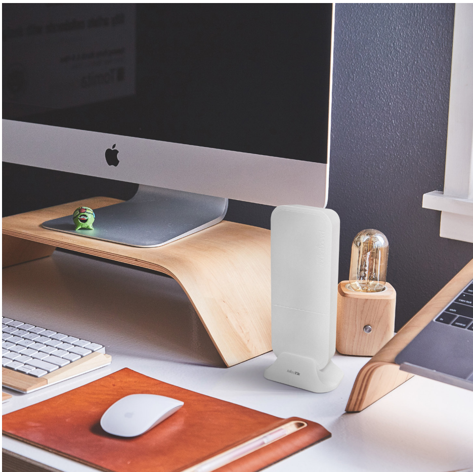
For home use