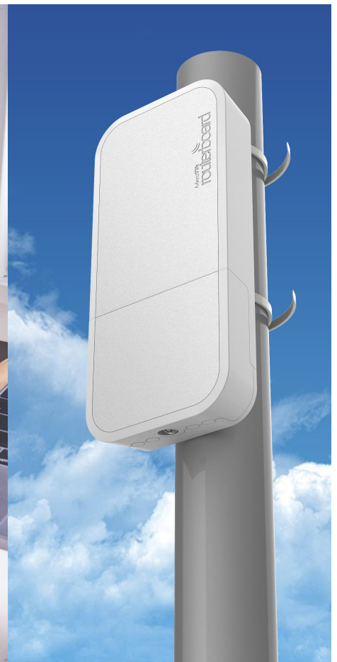
On the pole