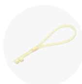
2x plastic straps