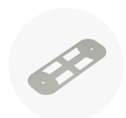
Ceiling mount base