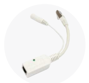
Gigabit PoE injector