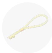
2x plastic straps