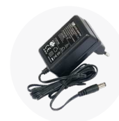
24V 0.8 A power adapter