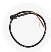
0.35 m 4pin Automotive adapter cable