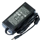
24V 2.5 A power adapter