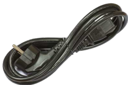
2 IEC cords