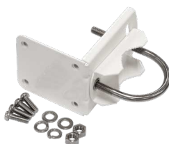
LHG precision mount