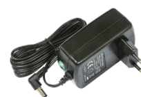
24 V 1.2 A power adapter included

IPsec hardware encryption (~470 Mbps) and The Dude server package are both supported, and the microSD slot provides improved read/write speed for file storage.